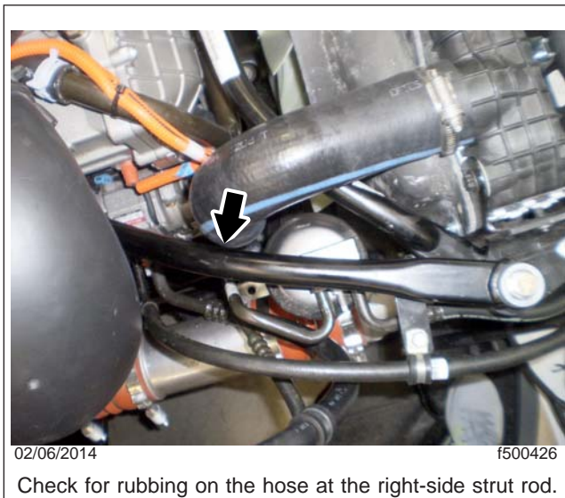
Fig. 1, Hose Rubbing Area, DD13 Engines

If there is evidence of rubbing, replace the hose and install a new strut rod. Refer to Table 1 under "Parts" for replacement strut rods by vehicle configuration.