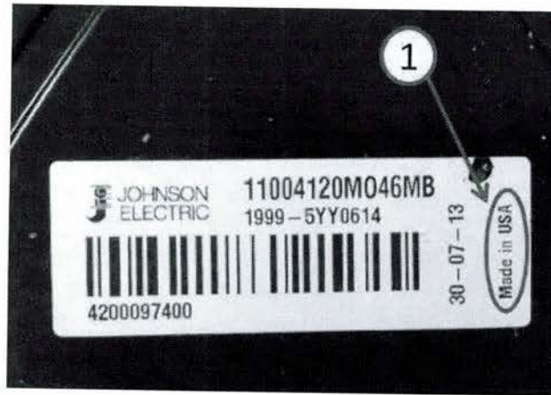
Fig. 1 Barcode Label