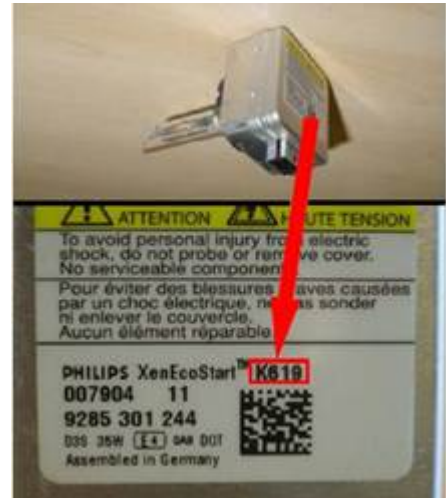
Figure 1. Location of the 4-digit alphanumeric production date code.