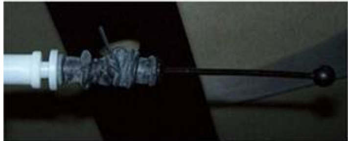
Figure 2. Distorted rubber grommets.

When the Bowden cable gets twisted during the installation, the rubber grommets can get distorted. Consequently, the Bowden cable has a too-high inner friction and the door lock does not move to the zero position (Figure 2).