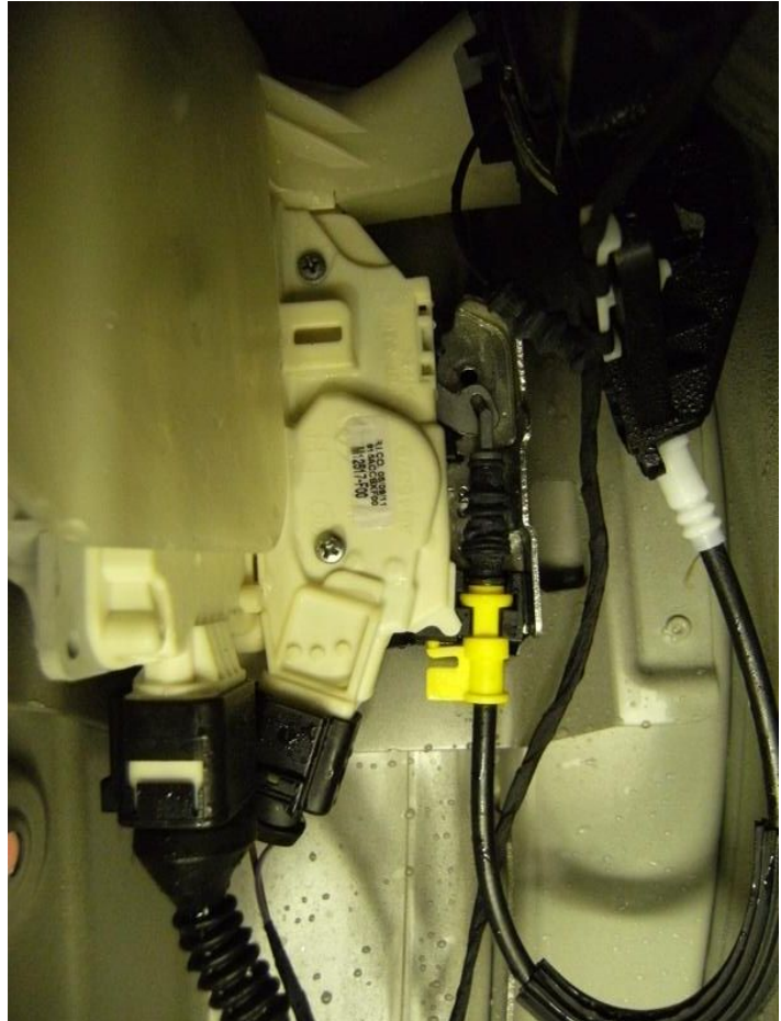
Figure 1. Bowden cable routing.

When fitting the Bowden cable from the mounting bar to the door lock, the cable can get kinked. In some cases, this can increase the inner friction of the strand in the Bowden cable. As a result, the door lock stays in pressed position or does not completely return to its zero position (Figure 1).