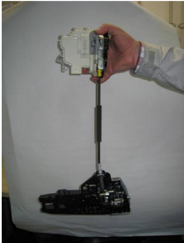
Figure 6. Do not turn the lock or the mounting bar.