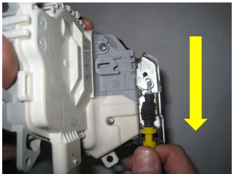
Figure 5. Pulling down the Bowden cable.