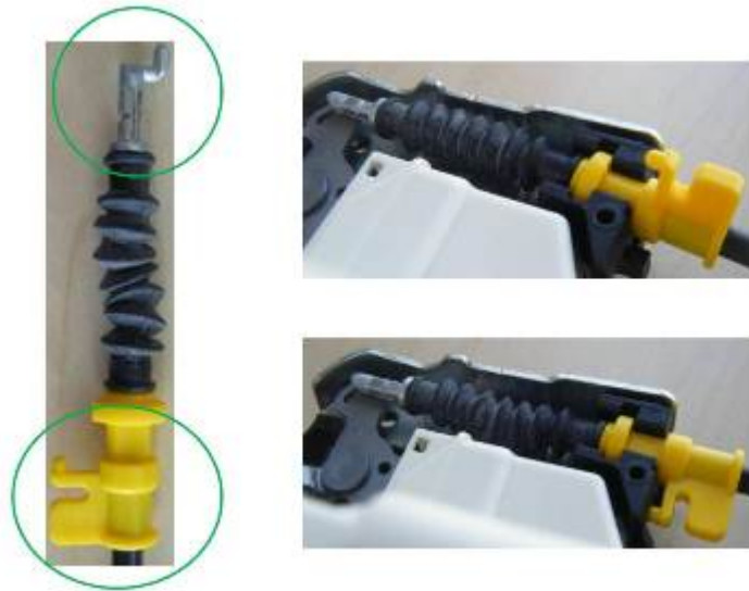
Figure 3. Improved cable.

Improved cable with 'L'-shaped attachment (Figure 3). Improved positioning of the locking collar.