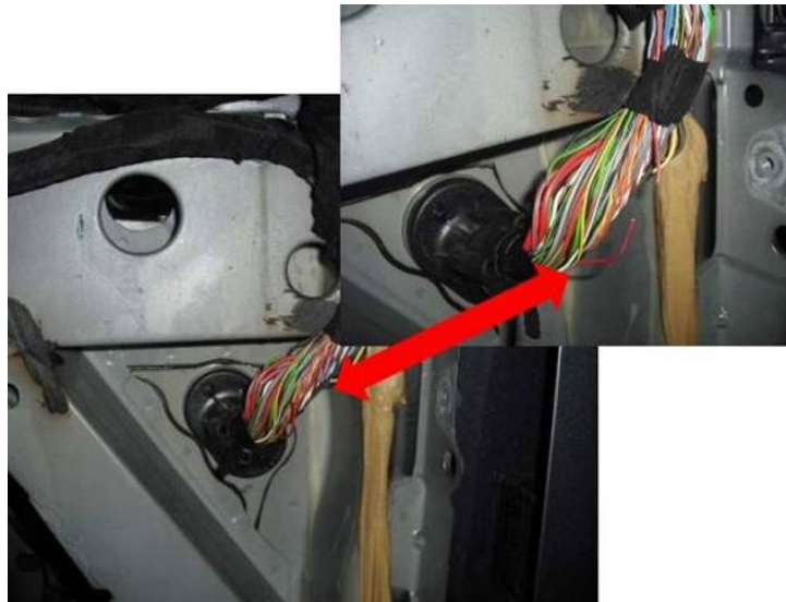
Figure 2. Affected area of the left front wiring loom behind the fender