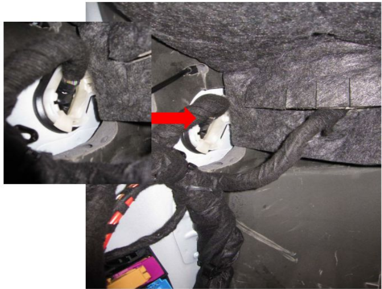
Figure 4. Grommet position photo, taken from inside the passenger compartment.