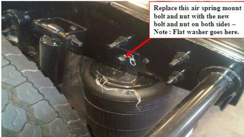
Figure 1 Air spring mount