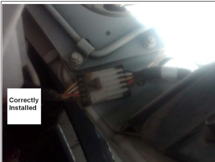
Figure 2: Correctly Installed