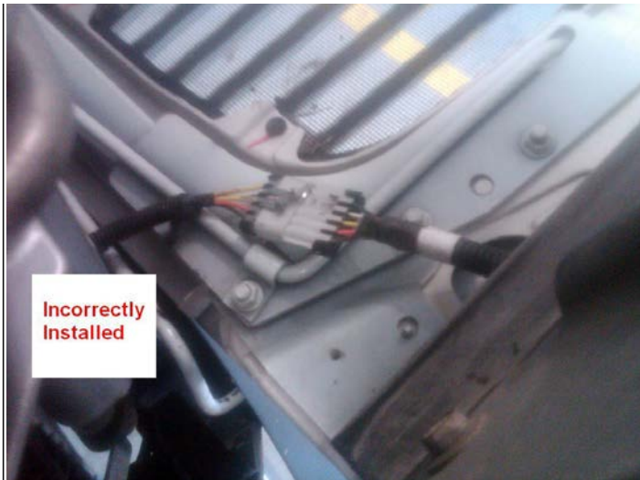
Figure 1: Incorrectly Installed