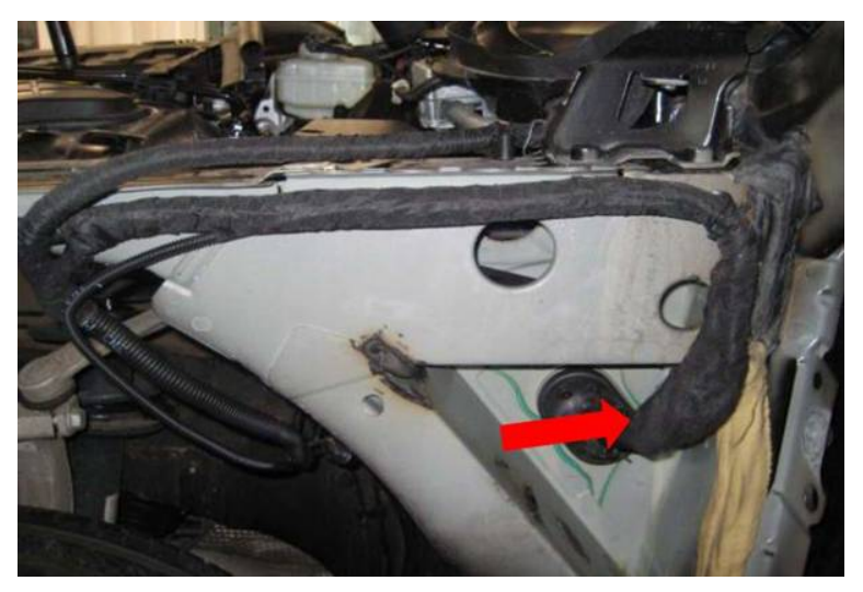
Figure 1. Left front fender is removed to show the left bulkhead grommet

The insulation for the ABS wheel speed sensor is damaged in production. Over time, this can lead to corrosion on the wires and restricted functions with the ABS control module. Only the wires in the left bulkhead grommet (Figure 1) are affected.