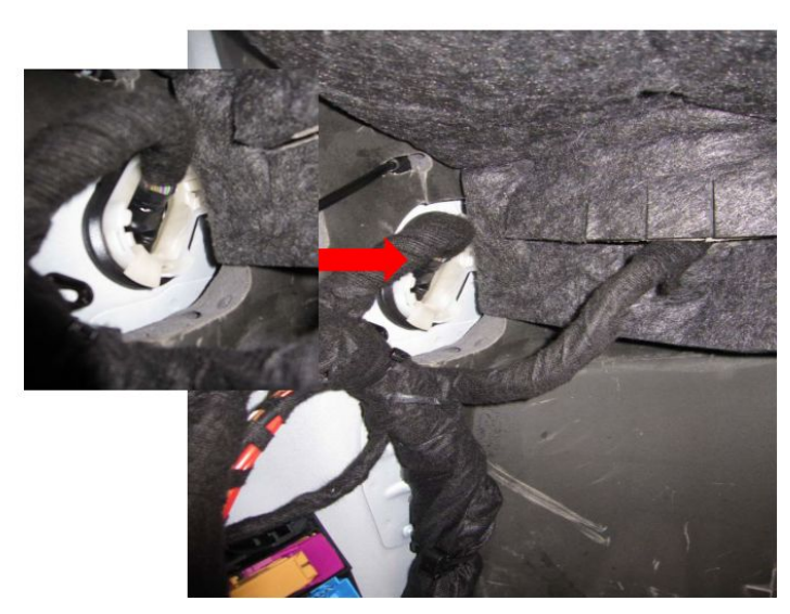
Figure 4. Grommet position photo, taken from inside the passenger compartment.