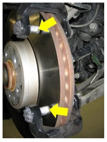
Figure 5. Caliper carrier guide pins with anti-seize lubricant applied where the pads make contact.

Apply a thin coat of anti-seize lubricant (G 052560A2) to the guide pins of the caliper carrier prior to installing the brake pads (Figure 5). Only apply the lubricant to the section of the guide pins that will be contacted by the brake pads.