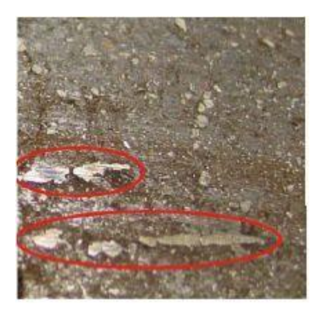
Figure 1. Metallic deposits.

Metallic deposits from disc material in brake pad (Figure 1).