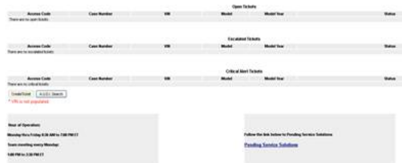
Figure 2. Technical Assistance page