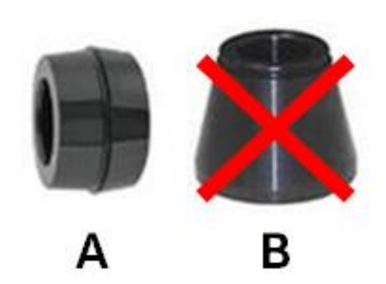
Figure 3. Example of a collet (A) vs. a centering cone (B).

Use of these tools ensures proper centering and mounting of the wheel on the balancer. Audirecommended collets can be ordered through Equipment Solutions (part number HUN2018451 ). An incorrect style of clamp could damage the wheel (Figure 4, C).