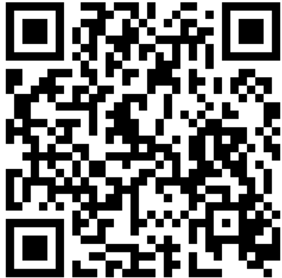
Figure 4. QR code for viewing the video with a QR code reader on phones and tablets. Alternatively, the video can be accessed through computer internet browsers at the link provided in this bulletin.

(Figure 4). See TSB 2039206 for more information about viewing videos.