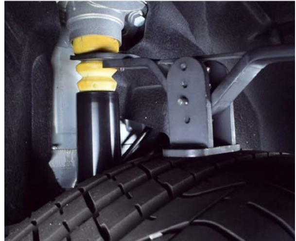
Figure 2. The SET900 tool being used to install a rear bump stop.