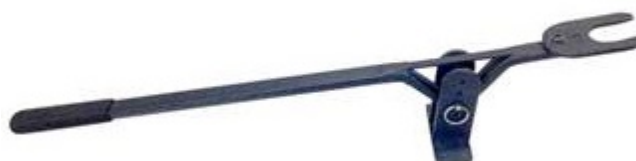
Figure 1. The SET900 bump stop installation tool.

Tip: One SET900 tool was sent to all Audi dealers in November 2014. Additional tools can be purchased through the Audi Special Tools and Equipment Program .