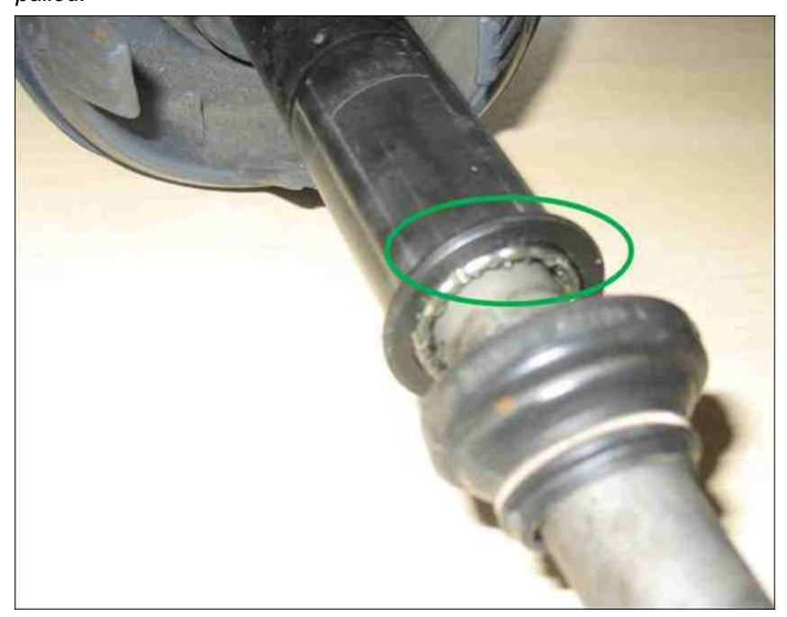
Figure 2. A correctly-fitted sleeve that is flush with the metal pipe. (The cap has been removed for this picture.)

2. If the plastic sleeve can be pulled down by hand, replace the intermediate steering shaft according to the repair manual instructions in Elsa.