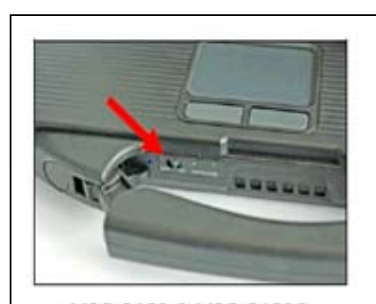
VAS 6150 & VAS 6150A (Front panel behind handle)