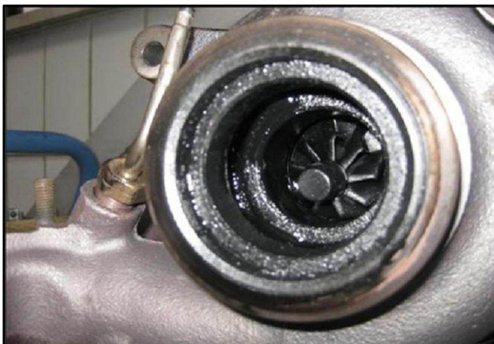
Figure 1 (broken turbocharger shaft, engine oil ingress on exhaust side)