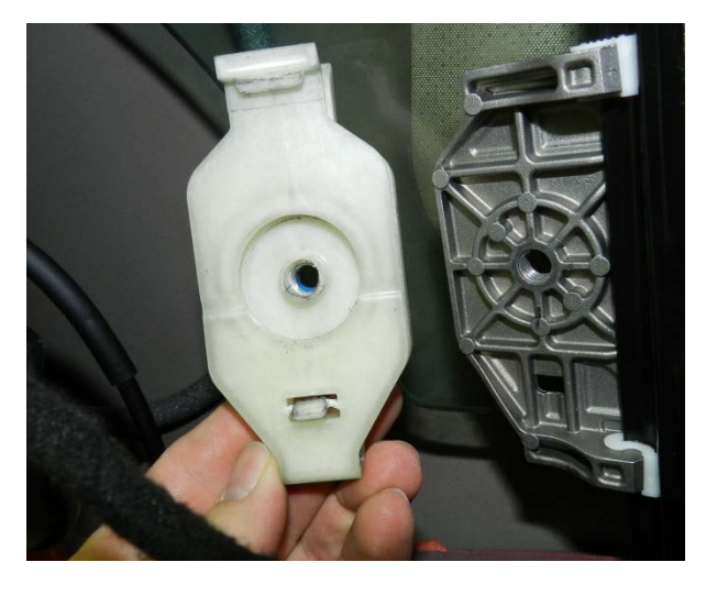
Fig. 4 Fig. 5

Apply a few drops of Loctite brand 242 medium strength thread locking compound (blue) to the threaded insert in the plastic regulator clamp. (See Fig. 5)