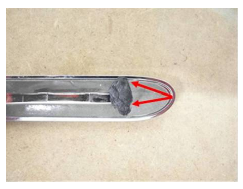
Figure 7 (front trim strip area)

• The open areas of the adhesive tape must be closed by pressing the butyl balls into the gaps of the tape (Figure 7).