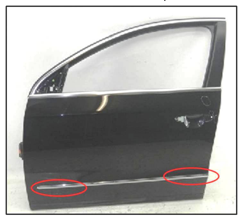
Figure 1 (the red ellipses show the area which can be affected by the corrosion)

Corrosion on the Front Door in Trim Strip Area