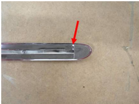
Figure 4 (front end of a trim strip)