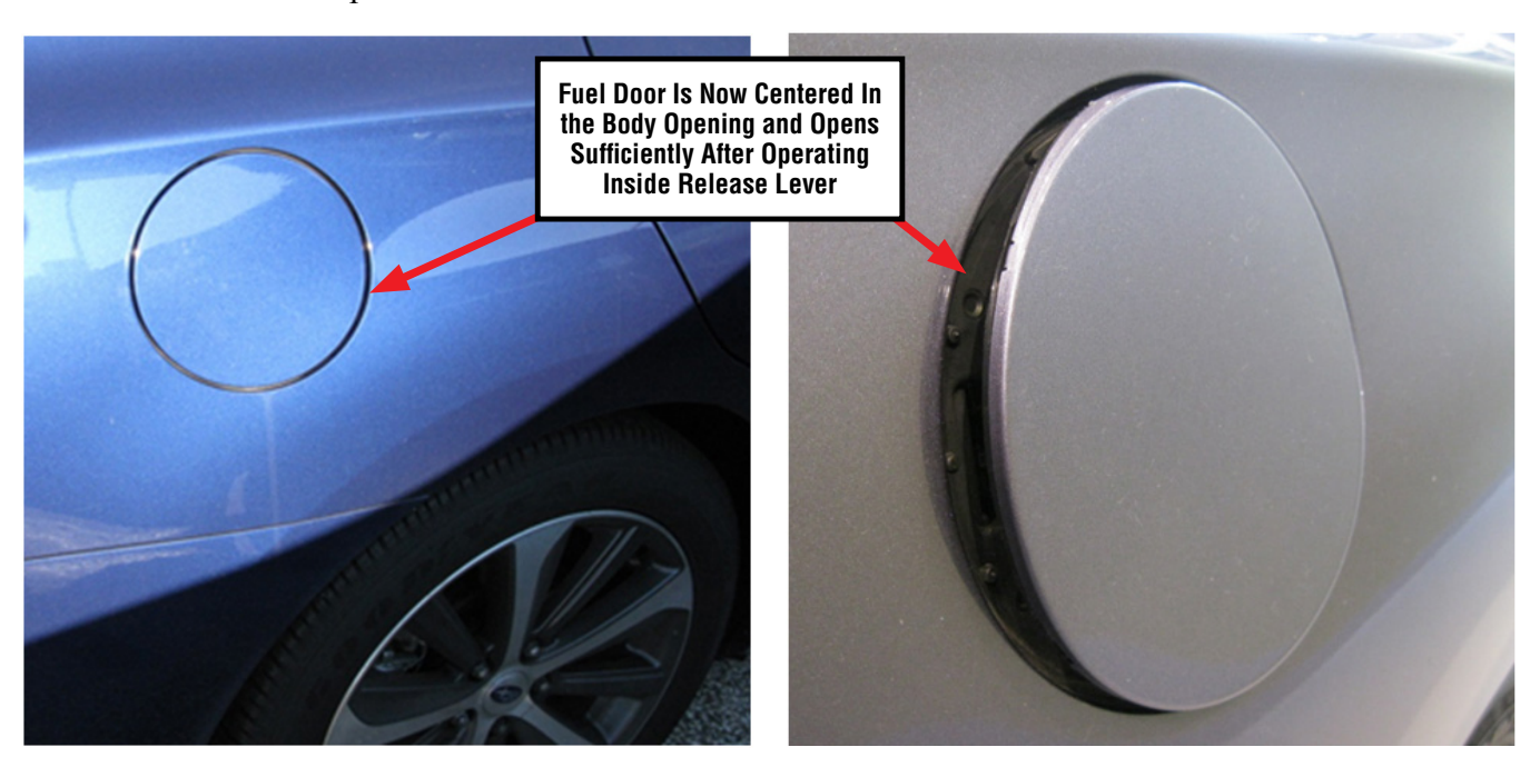
Step 6- Confirm proper fit of the fuel door to the body and verify proper inside release lever operation. If the condition(s) persist, the complete fuel door / saucer assembly will need to be replaced.