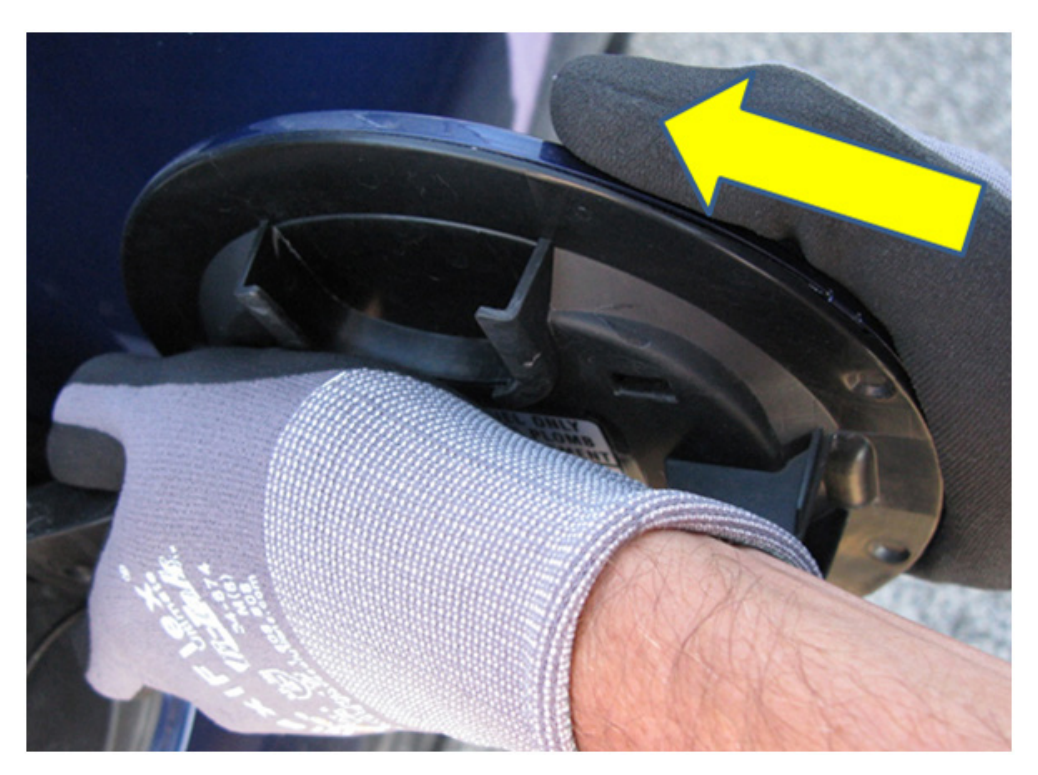
Step 3- Reinstall the 10mm cap nut and torque to 5.5 ft. lbs.

Step 2- Fully extend the filler door to the open position. While supporting the plastic portion of the filler door assembly with one hand, push the outer body color panel inward toward the body with the other hand to shift the relative position of the outer body color panel on the plastic inner filler door. In some cases, when the outer panel shifts inward, a "click" sound may be heard.