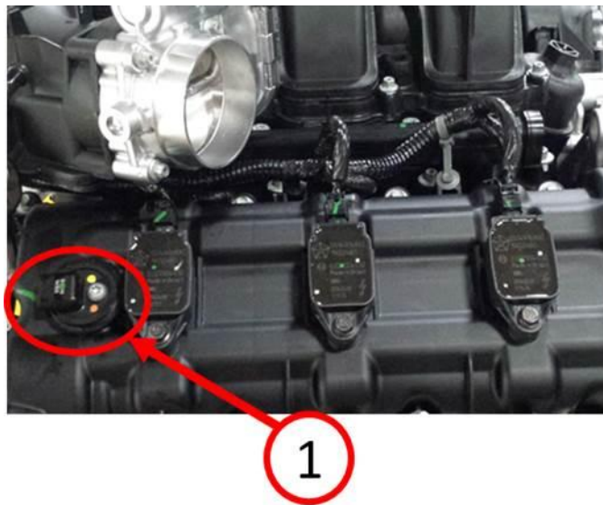
Fig. 1 Camshaft Position Sensor Location