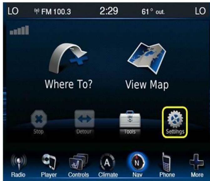
Fig. 5 Settings Screen Icon

19. Select the Settings Icon. See (Fig. 5).