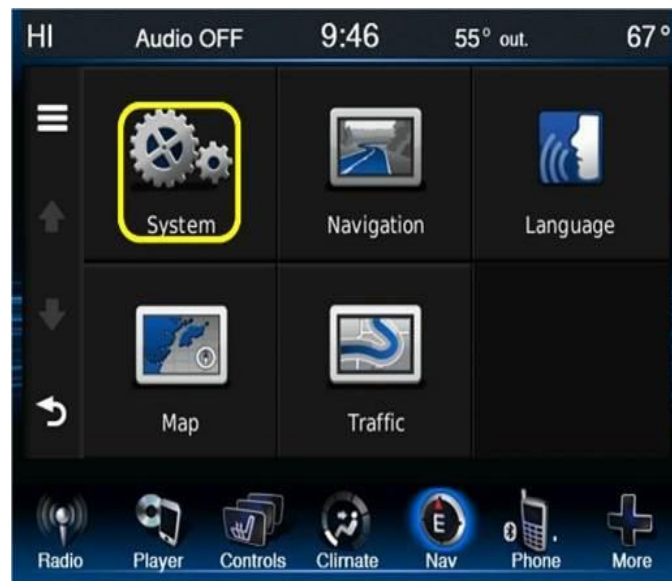
Fig. 6 System Screen Icon