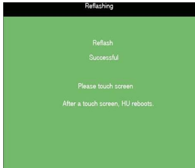
Fig. 3 Touch Screen Instruction