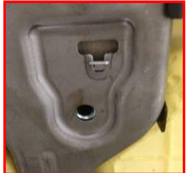
Missing Retractor Bolt