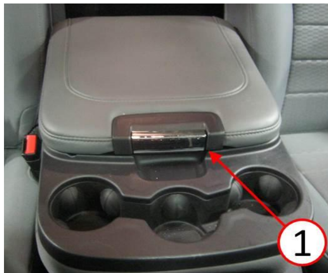
Fig. 2 Armrest Lid