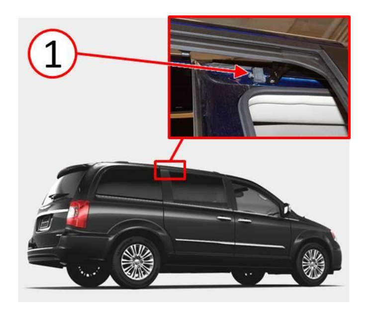
Fig. 1 Remove Bumper