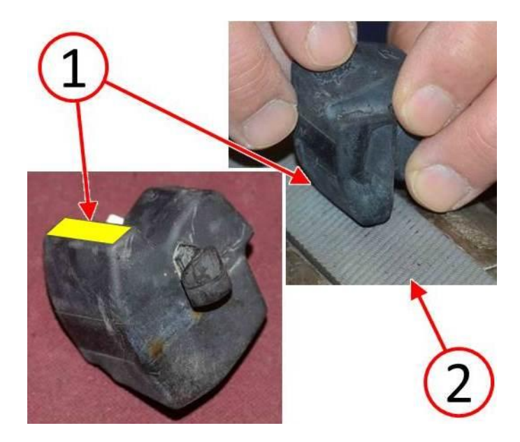
Fig. 2 Modify Bumper