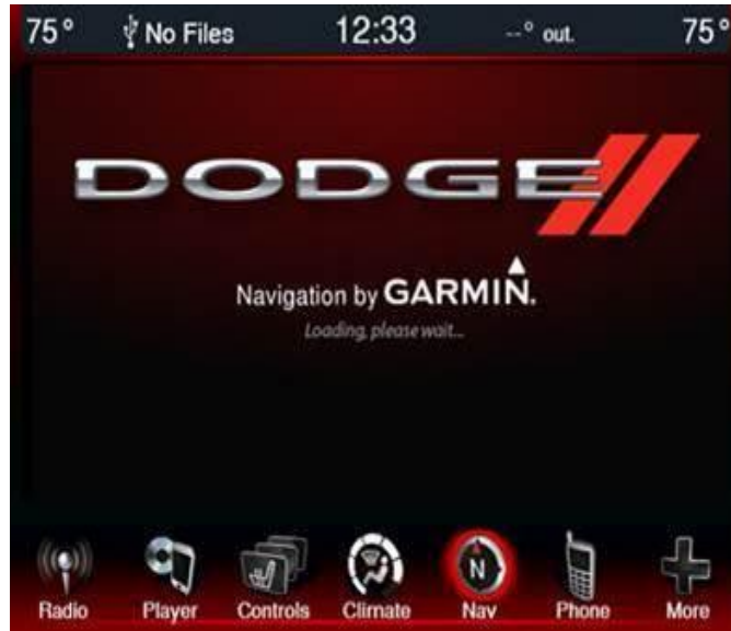
Fig. 1 System Loading Screen