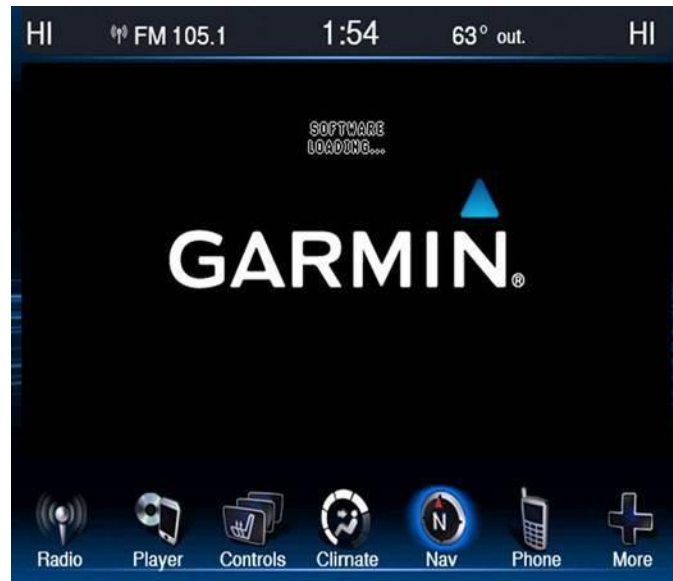
Fig. 8 Garmin software loading

CAUTION: Do not interrupt the software update process once it has begun. It may cause permanent damage to the radio which will require replacement.