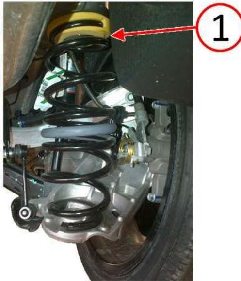
Fig. 1 Spring Seat Upper Isolator