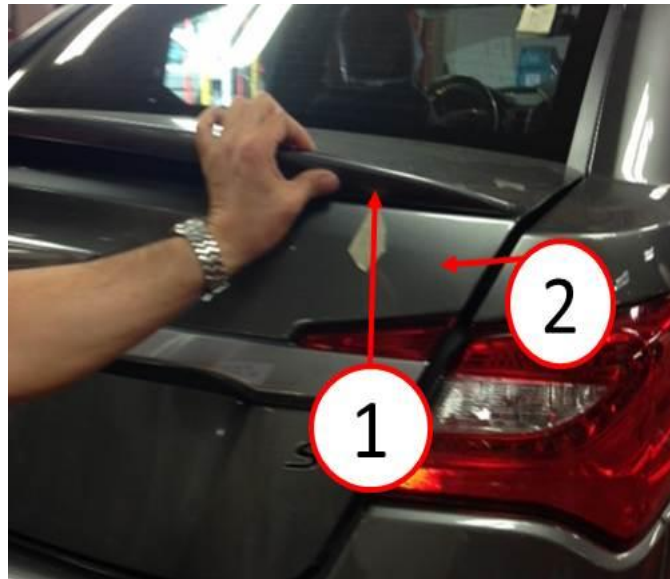
Fig. 1 Spoiler Inspection 1