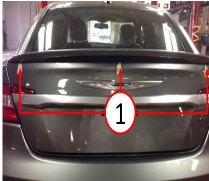
Fig. 2 Spoiler Inspection 2

1 - Areas to apply vertical upward finger load