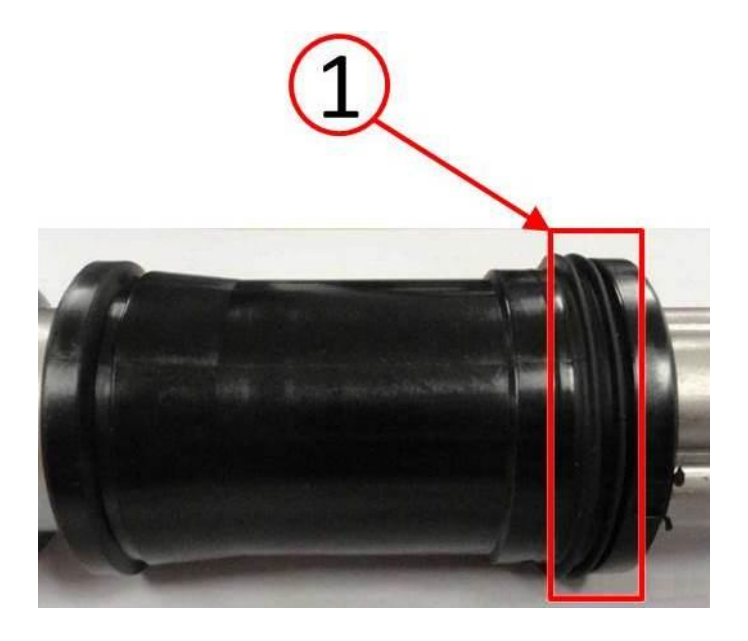
Fig. 3 Wiper Seal To Be Removed