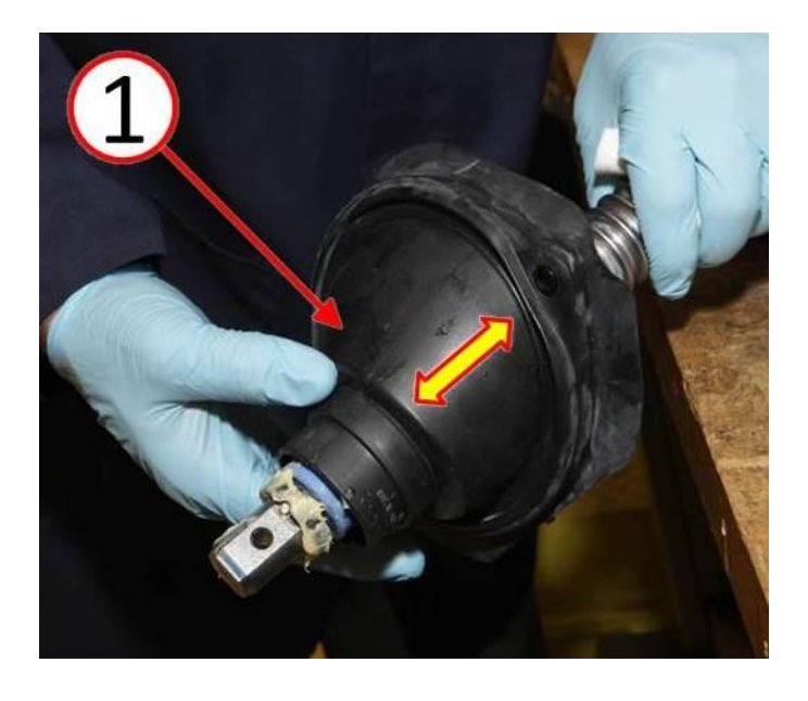
Fig. 9 Check Installation