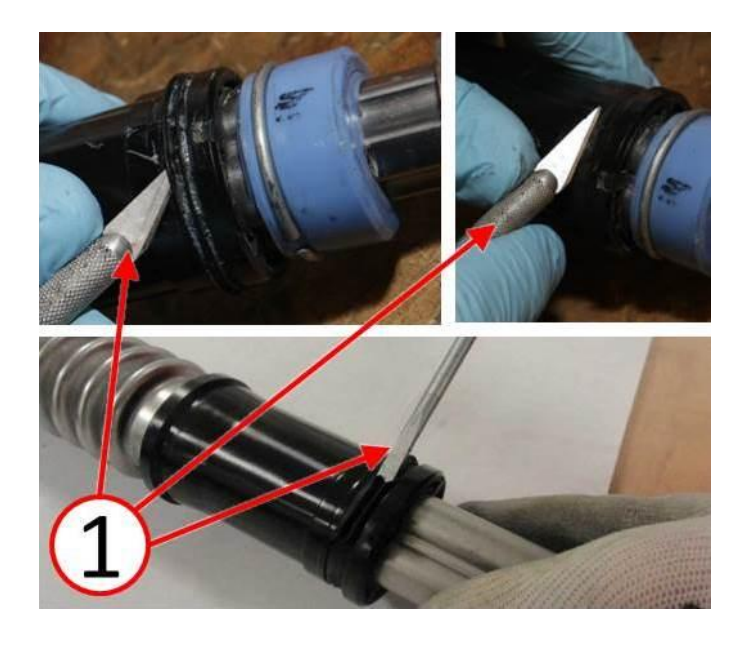
Fig. 4 Wiper Seal Removal