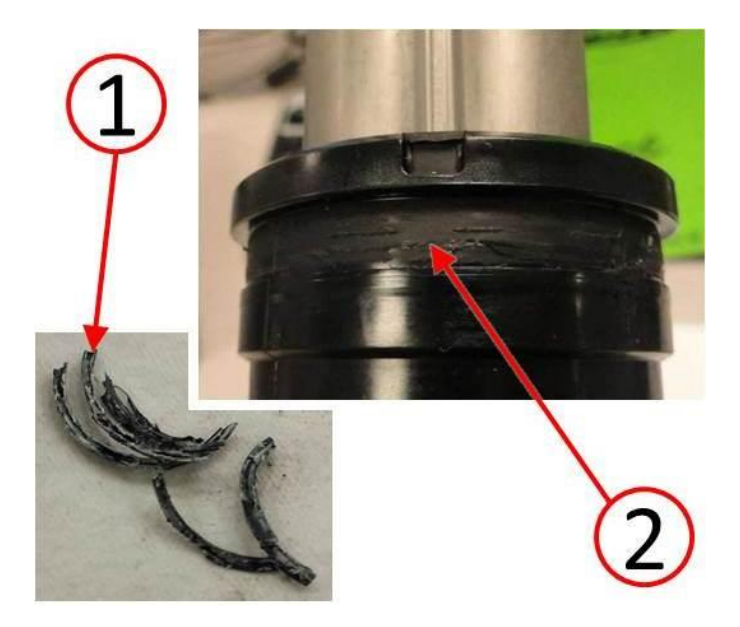
Fig. 5 Wiper Seal Removed

5. Ensure that the rubber wiper seal (1) has been completely removed from the plastic inner bearing sleeve (2) (Fig. 5).