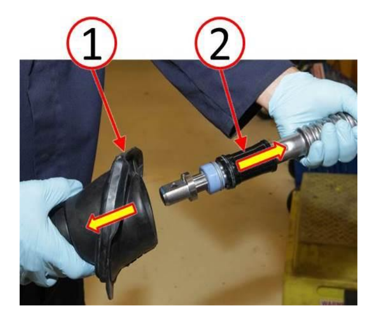
Fig. 2 Remove Boot From Intermediate Shaft