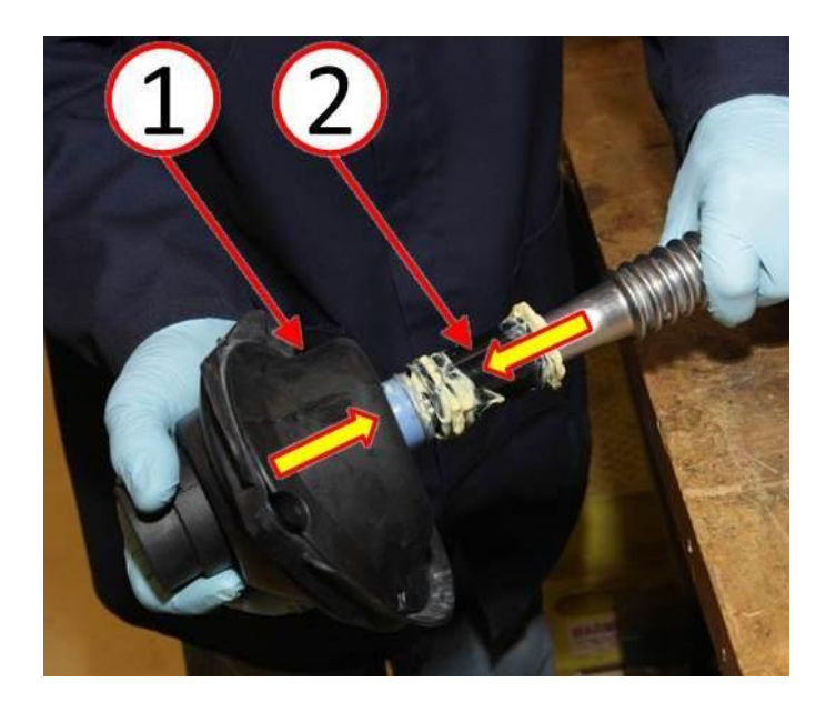
Fig. 8 Install Boot To Intermediate Shaft

8. Use a quick push action to install the intermediate shaft bulkhead pass through boot and outer bearing sleeve assembly (1) to the intermediate shaft inner bearing sleeve (2) (Fig. 8).