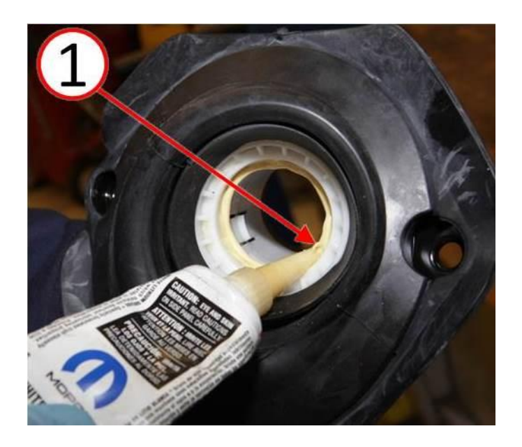
Fig. 7 Apply White Lithium To Outer Bearing Sleeve

7. Apply white lithium grease to the contact surface at each end of the outer bearing sleeve (Fig. 7).