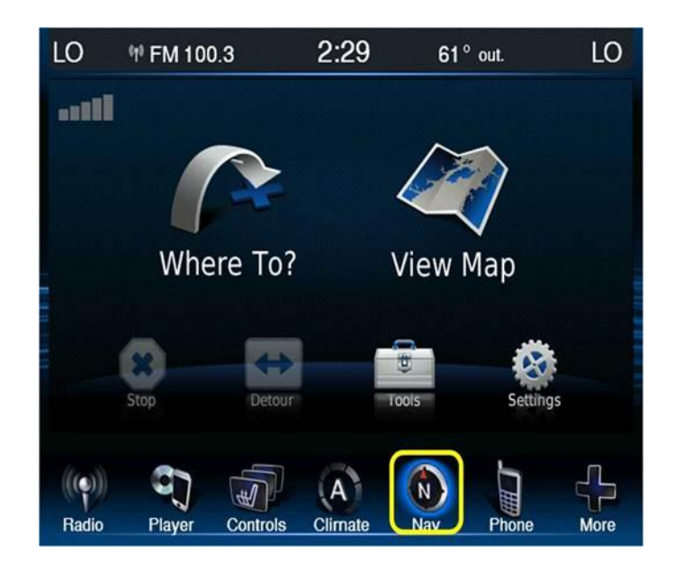
Fig. 9 Update Complete

25. Once the software update has completed down loading, the screen will automatically change to the Garmin main screen. See (Fig. 9).