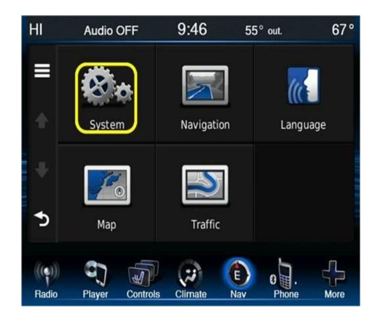
Fig. 6 System Screen Icon