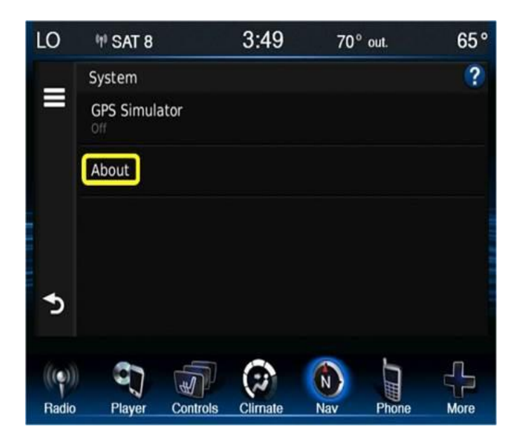
Fig. 7 About Screen Icon