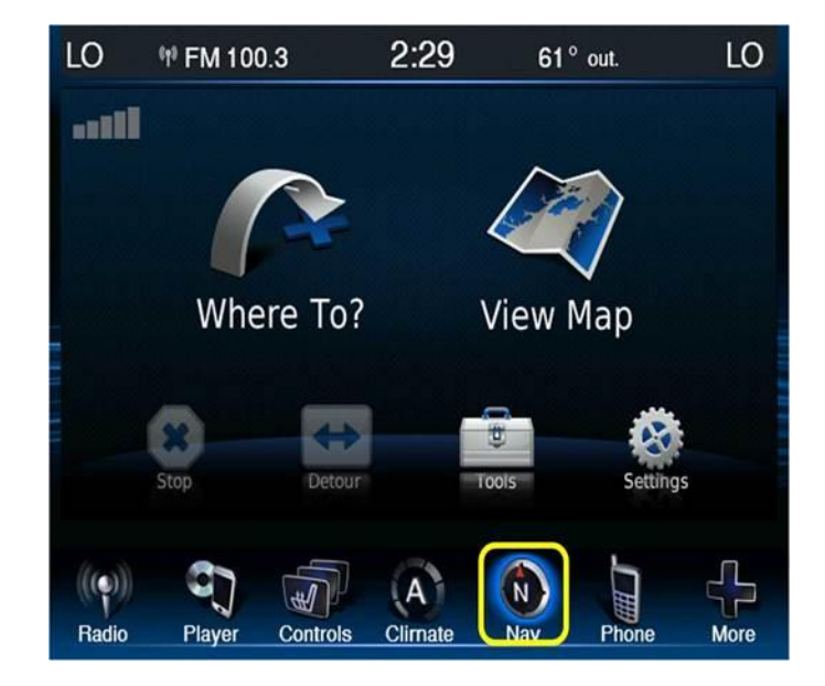
Fig. 4 Nav Screen Icon

19. Select the Settings Icon. See (Fig. 5).