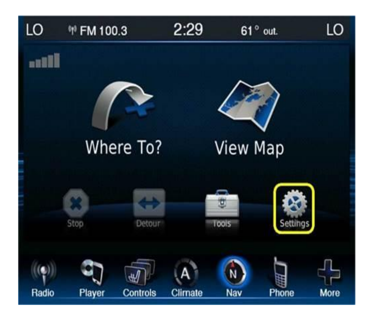
Fig. 5 Settings Screen Icon

19. Select the Settings Icon. See (Fig. 5).