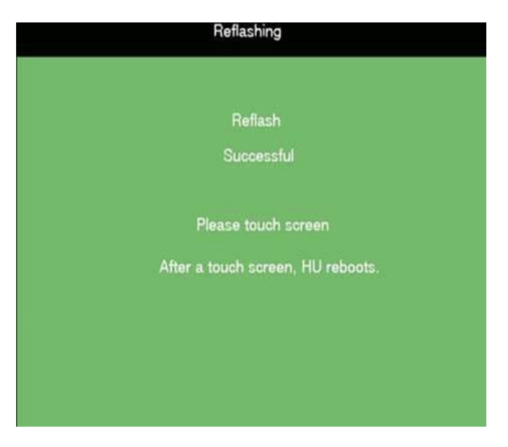
Fig. 3 Touch Screen Instruction

When the update is completed, the screen will read "Reflash Successful". Remove the USB flash drive and touch the screen anywhere to initiate the radio to reboot. See (Fig. 3).