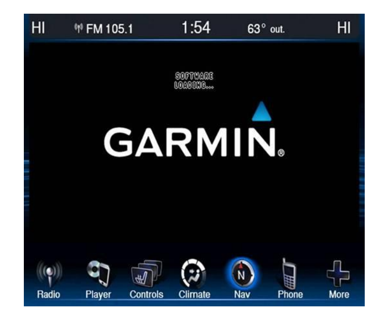
Fig. 8 Garmin Software Loading

25. Once the software update has completed down loading, the screen will automatically change to the Garmin main screen. See (Fig. 9).