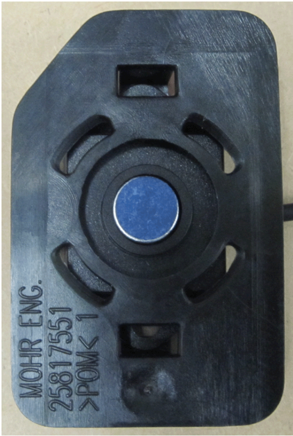
The old ANC microphone, P/N 25783504, has locking tabs with no mounting holes, as shown in the illustration above, which holds the microphone in place on the insulator.