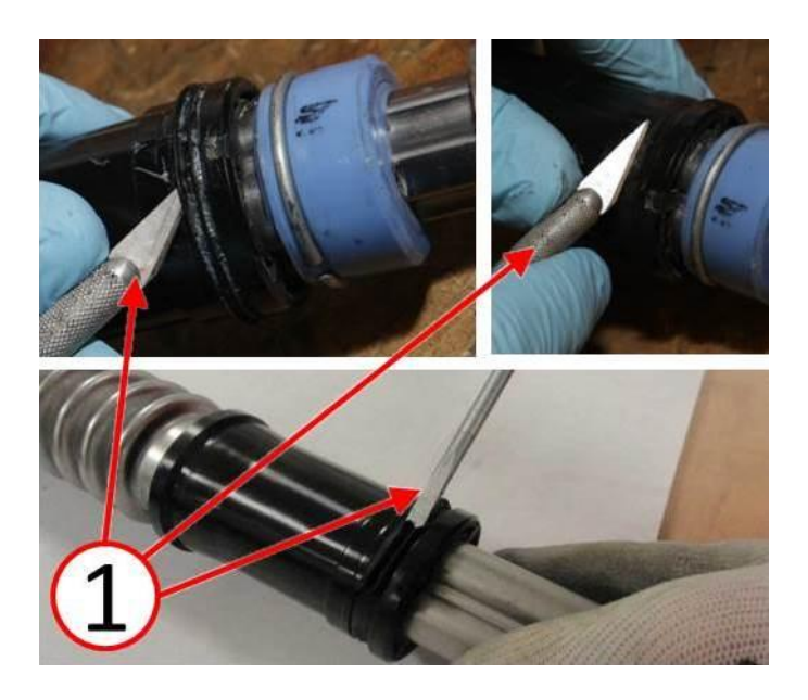
Fig. 4 Wiper Seal Removal