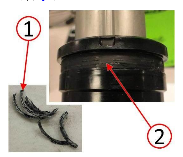
Fig. 5 Wiper Seal Removed

5. Ensure that the rubber wiper seal (1) has been completely removed from the plastic inner bearing sleeve (2) (Fig. 5).