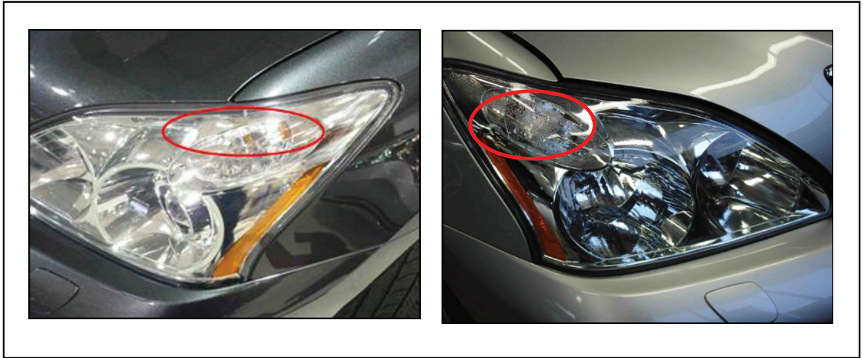
Figure 3. Examples of Normal Moisture

Figure 3 shows normal moisture on the interior of the headlamp lens.