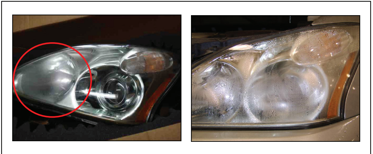
Figure 2. Examples of Excess Moisture: Streaks

Figure 2 shows noticeable streaks that run down the interior of the headlamp lenses that do not clear with normal use of the vehicle in dry weather conditions.