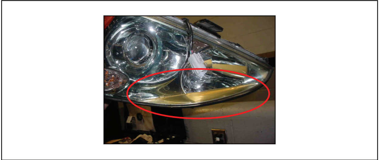
Figure 1. Examples of Excess Moisture: Pooling

Figure 2 shows noticeable streaks that run down the interior of the headlamp lenses that do not clear with normal use of the vehicle in dry weather conditions.