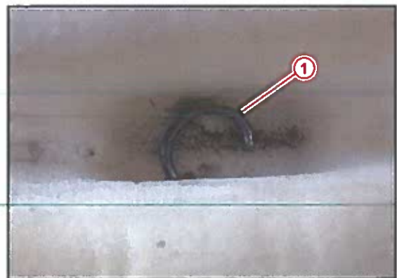
1 Remove Clipped Hog Rings