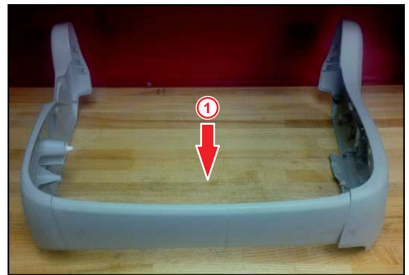
1 Front of Vehicle