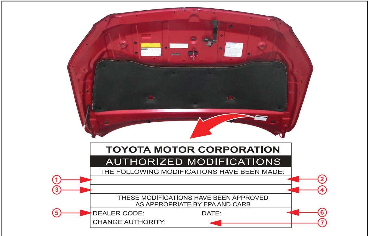
Figure 1. Location of Authorized Modifications Label on 2012 – 2014 RAV4 EV