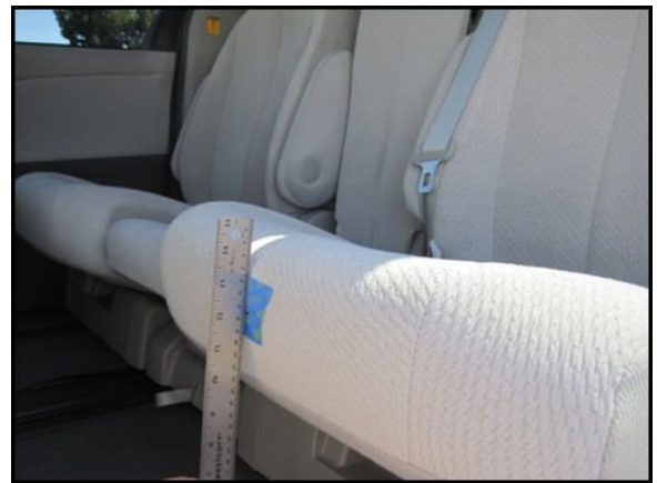
Figure 1. Example of Seat Measurement

Refer to the video link below for an example of the Seat Measurement: