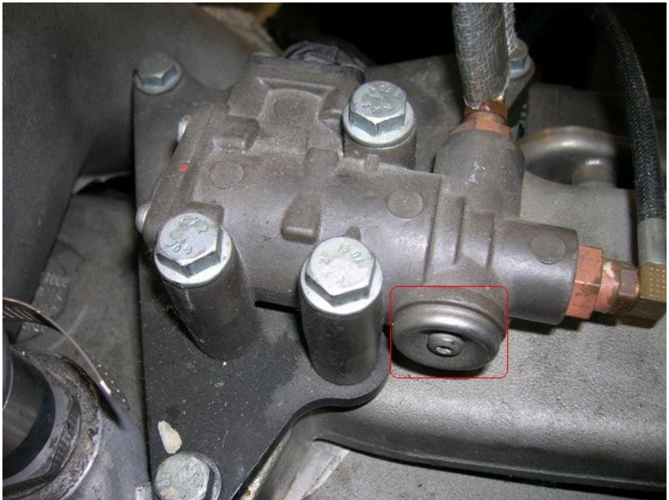
(Figure 1, EGR control valve exhaust port)