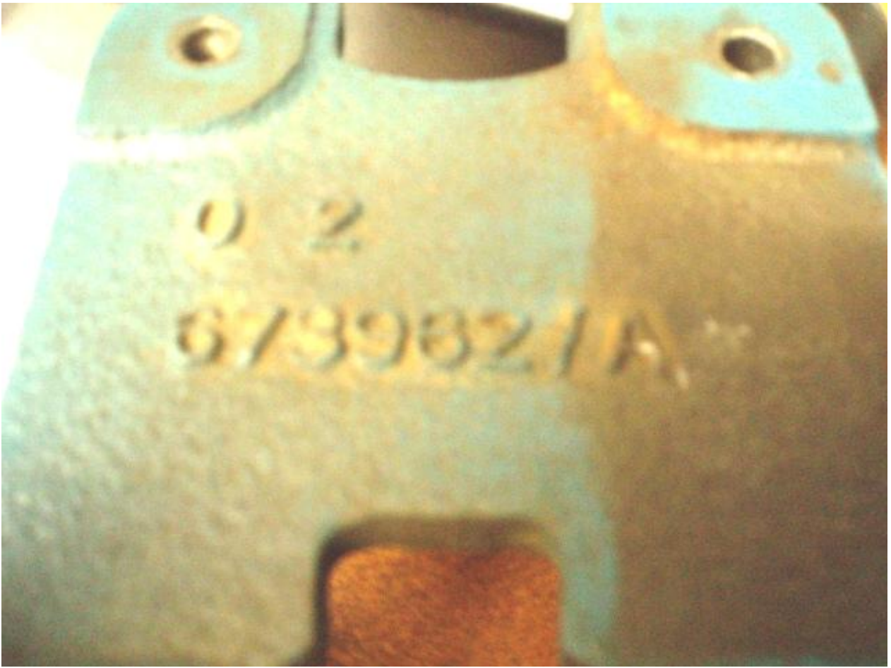
Flange with casting number that cannot use the service flange kit.