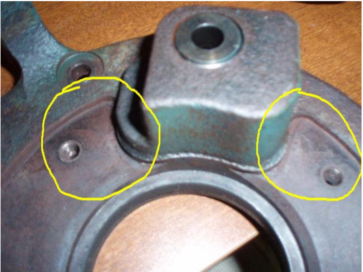
Old style flange above cannot use flange service kit. (Areas in yellow highlight difference between the two)