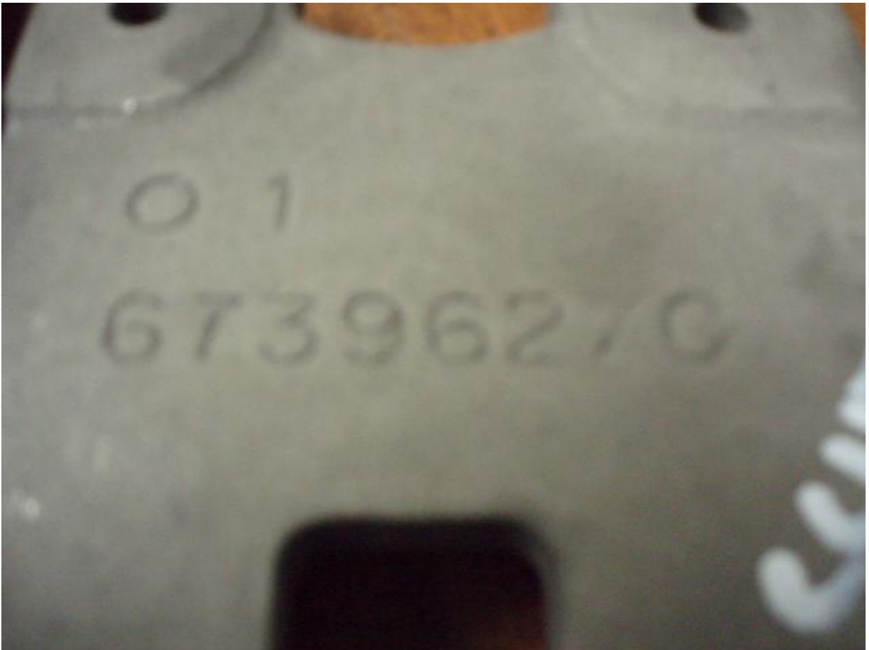
Flange with casting number that can use the service flange kit.