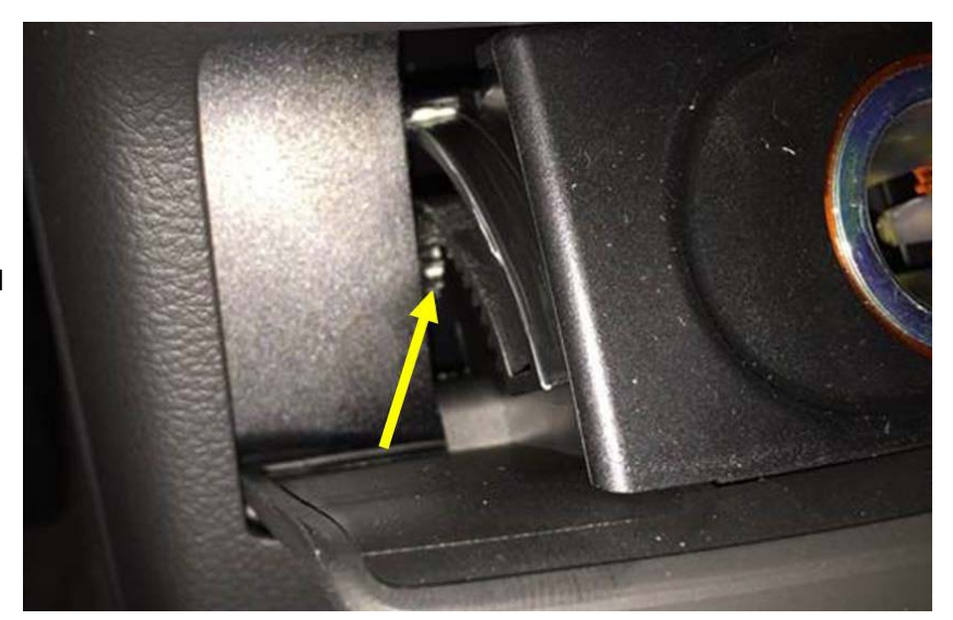
Figure 1. Slow release brake wheel.

Ensure that the slow release brake wheel (Figure 1) is not damaged or missing. The slow release brake wheel prevents the compartment from opening too quickly.