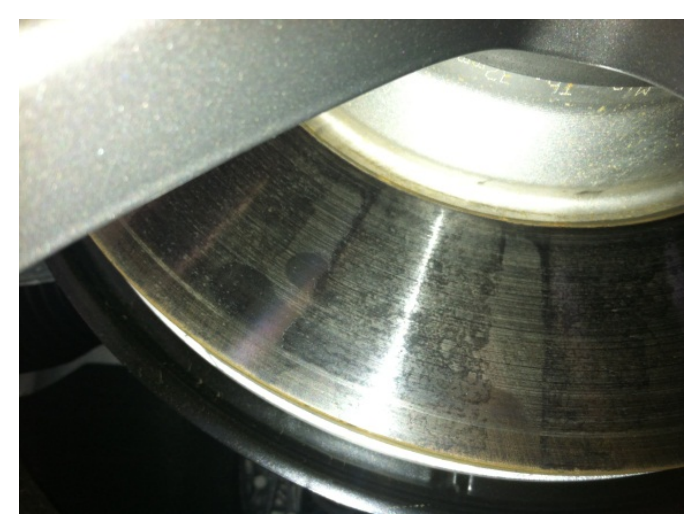
Figure 3 . Discoloration on the brake disc due to chemical contamination from cleaner that was sprayed directly onto the disc.

There is chemical contamination on the braking surface of the brake disc due to wheel or tire cleaner being sprayed directly onto the brake disc (Figure 3 and Figure 4).