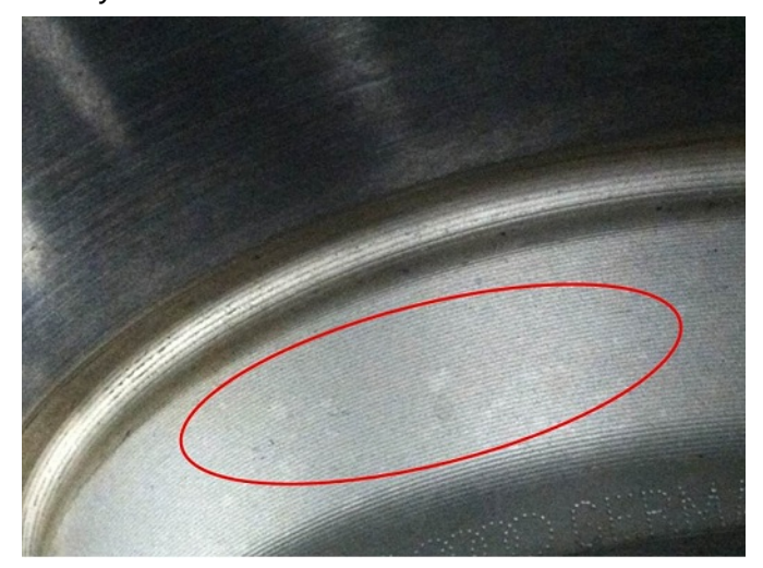
Figure 4 . Small spots and discoloration due to chemical contamination from cleaner that was sprayed directly onto the disc.