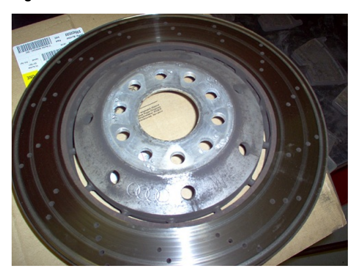
Figure 2. Grooved disc.