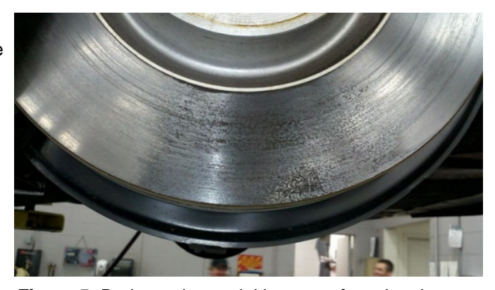
Figure 5. Brake pad material has transferred to the discs.

There are "pad marks" on the brake disc as a result of brake pad material transferring to the discs (Figure 5). Pad marks can occur when a vehicle has been parked for long periods of time in a wet or snowy environment.