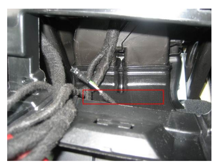
Figure 7. Mounting surface on HVAC ducting to be cleaned.

Prepare the mounting surface by cleaning the marked area with cleaning solution ( D 009 401 04 ) (Figure 7).