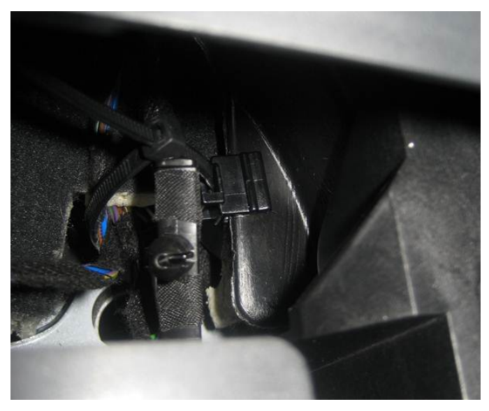
Figure 4. The zip tie with holder is installed but not tightened.

6. Attach the zip tie with holder as shown (Figure 4). Do not tighten the zip tie.