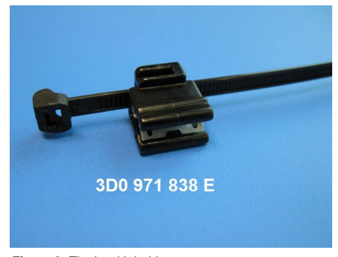
Figure 2. Zip tie with holder.

5. Using a zip tie with holder ( 3D0 971 838 E ) (Figure 2), turn the zip tie by 90° (Figure 3).