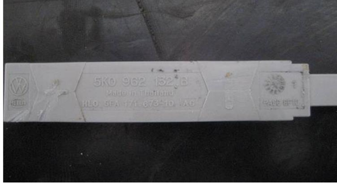
Figure 5. Removing the plastic locating pins from Aerial 1 (top image), and Aerial 1 with locating pins removed (bottom image).