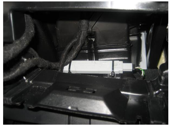
Figure 8. Aerial 1 mounted on HVAC ducting.

10. Once the area is dry, attach Aerial 1 to the HVAC ducting (Figure 8).