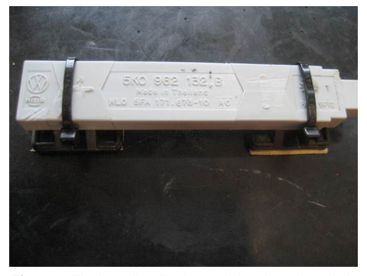
Figure 6. Zip ties with adhesive retaining plates installed on Aerial 1.

Attach zip ties (N 020 904 8) and the retaining plates for zip ties (000 971 010 A) as shown (Figure 6).