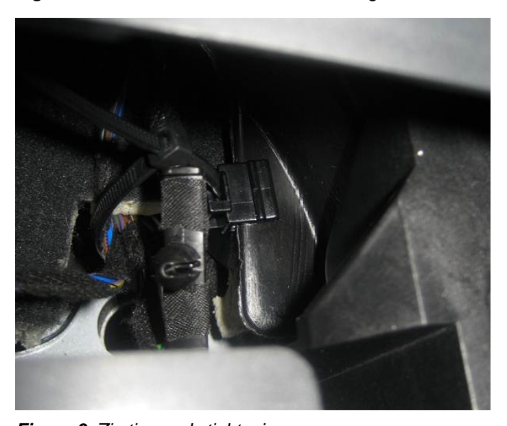
Figure 9. Zip tie needs tightening.

11. Tighten the zip tie and cut off any excess material (Figure 9). Rotate so that the sharp edge of the zip tie will not interfere with any cables in the area.