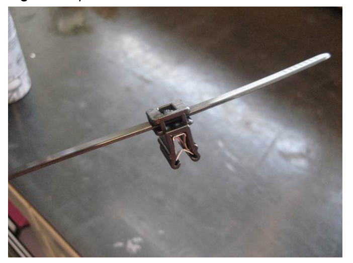
Figure 3. Zip tie turned by 90°.