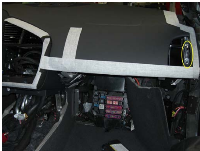
Figure 1. Right instrument panel vent removed.