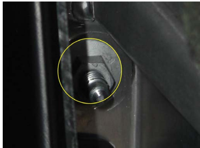
Figure 3. Instrument panel carrier nut to be marked.