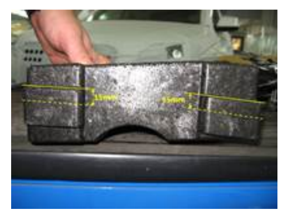
Figure 9. 15mm section of the pad legs to be removed.

Using a razor knife, make a horizontal cut flush with the pad body and 15mm deep (Figure 10). Then make an intersecting vertical cut 15mm from the outer face of the pad (Figure 11). Remove the cut-out.