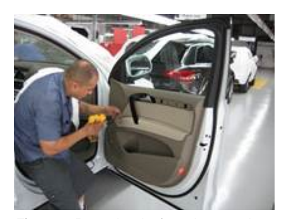
Figure 1. Removing the front door panel.

1. Remove the front door panel (Figure 1).