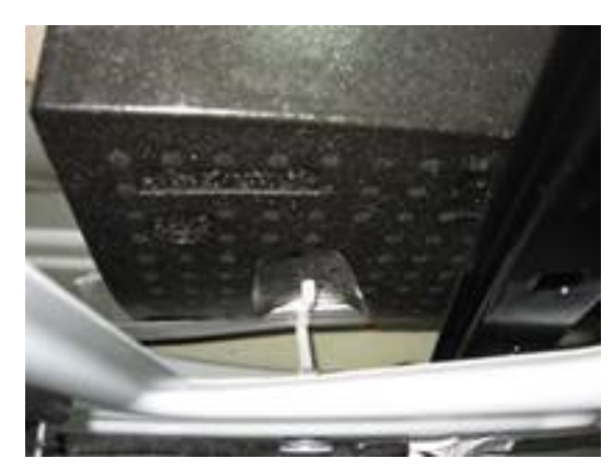
Figure 6. Zip tie cut.