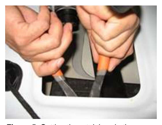
Figure 5. Cutting the retaining zip tie.

5. Cut the zip tie (Figure 5 and Figure 6). Remove the pad with the cut zip tie from inside the door. Discard the zip tie (Figure 7).