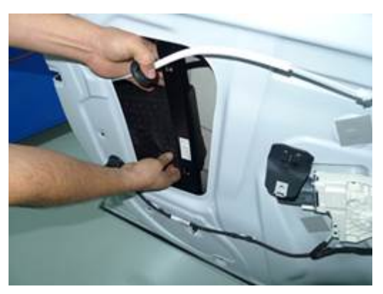
Figure 14. Reinstalling the lower pad.

10. Reinstall the lower pad into the door shell (Figure 14).