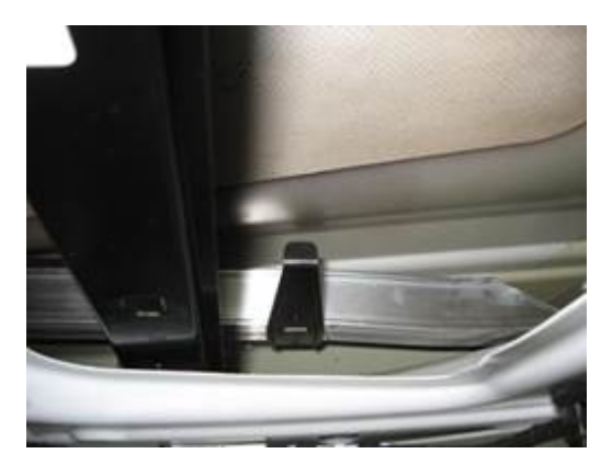
Figure 13. Retaining bracket installed on the impact beam.

9. Snap the retaining bracket for the pad onto the impact beam (Figure 13).