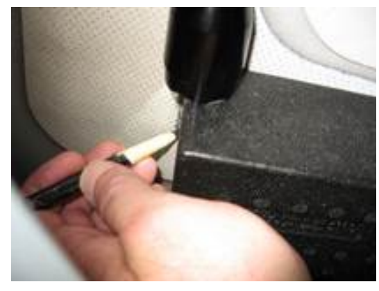
Figure 4. Marking the position of the pad.

Using a marker, mark the inside of the door skin along the rear facing edge of the pad (Figure 4). Doing so will aid in positioning the pad on reassembly.