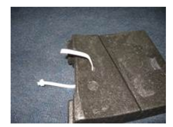
Figure 7. Pad with zip tie removed.