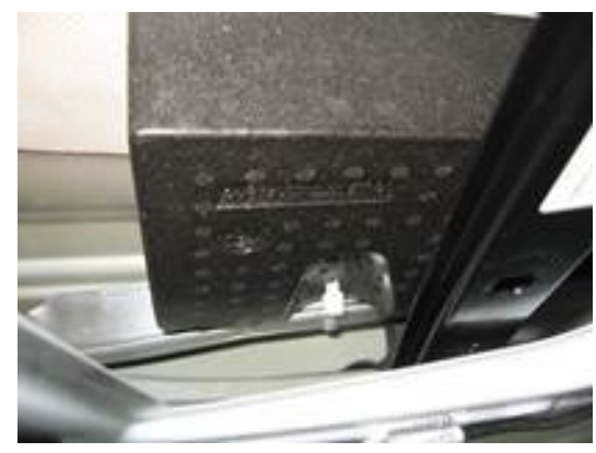
Figure 3. Lower pad secured to impact beam.

3. With the cover removed, the lower pad will be visible. It is secured to the impact beam using a zip tie (Figure 3).