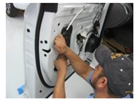
Figure 2. Removing the inner door panel cover

2. Carefully unclip the inner door panel cover (Figure 2).