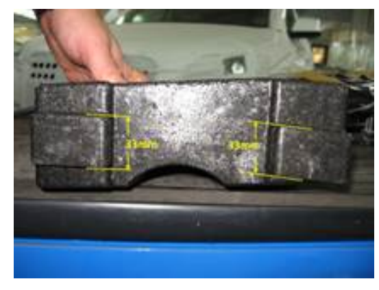
Figure 8. Pad legs with an original width of 33mm.

6. Review the images at right (Figure 8 and Figure 9) to see how the pad legs will be modified in the next step. 15 mm of width must be removed.