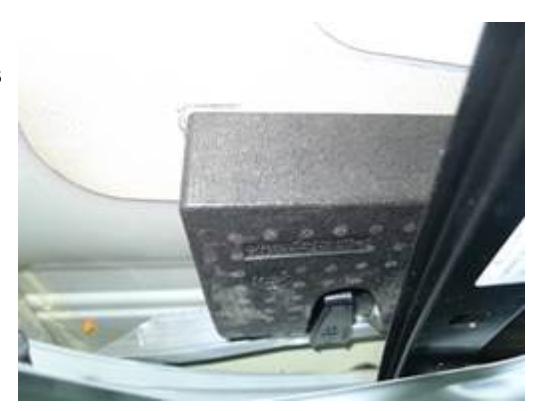
Figure 15. Lower pad installed to the correct position.

11. Using the mark that was previously made on the inside of the door skin as a guide, install the lower pad (Figure 15). The legs should rest on the top of the impact beam. Press the pad against the door skin so that the butyl strips stick the pad securely to the door skin. If necessary, slide the bracket along the impact beam so that the bracket correctly engages the slot in the pad.