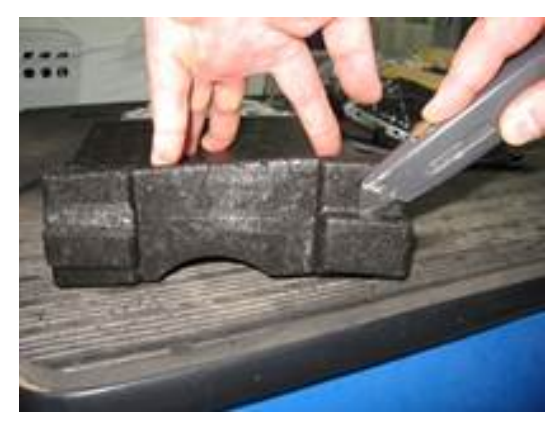
Figure 10. Making the horizontal cut.

Using a razor knife, make a horizontal cut flush with the pad body and 15mm deep (Figure 10). Then make an intersecting vertical cut 15mm from the outer face of the pad (Figure 11). Remove the cut-out.