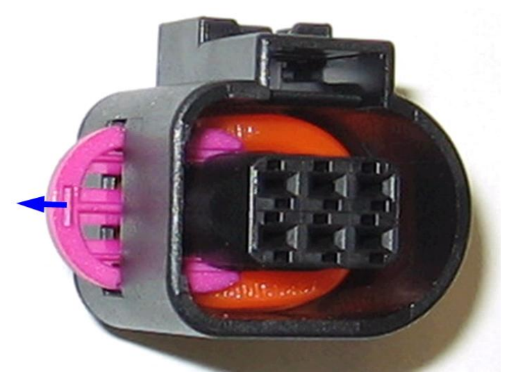
Figure 2. The slot to be used to remove the pink lock.

4. On the new housing, remove pink lock with small flathead screwdriver, using the slot on the pink lock (Figure 2).