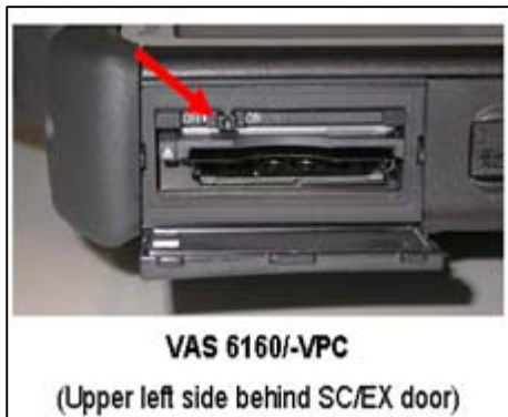
VAS 6160/-VPC (Upper left side behind SC/EX door)