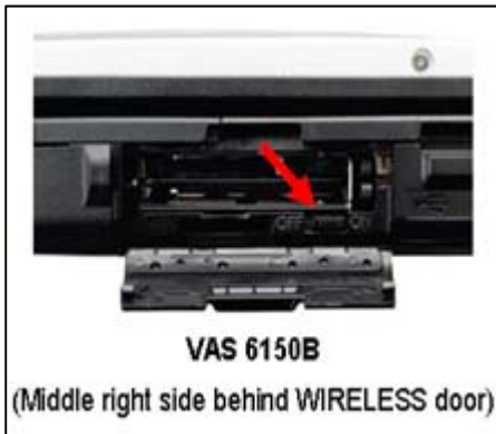
VAS 6150B (Middle right side behind WIRELESS door)