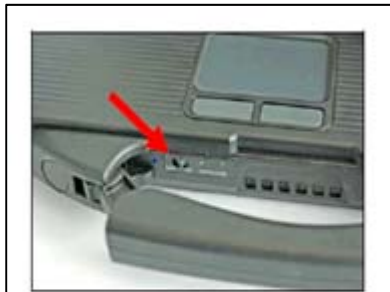
VAS 6150 & VAS 6150A (Front panel behind handle)