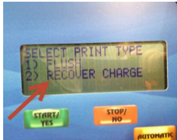
Figure 5. Selecting a print type.