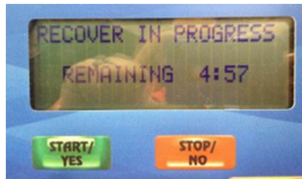
Figure 2. System recover in progress.