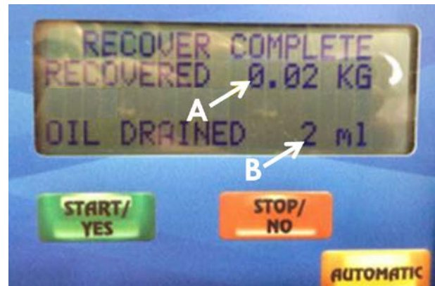
Figure 3. Amount of refrigerant recovered (A), and amount of oil drained (B).