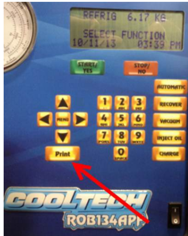
Figure 4. Location of the Print button.