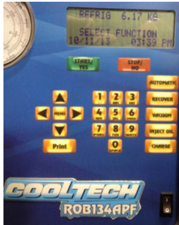
Figure 1. Date and time screen.