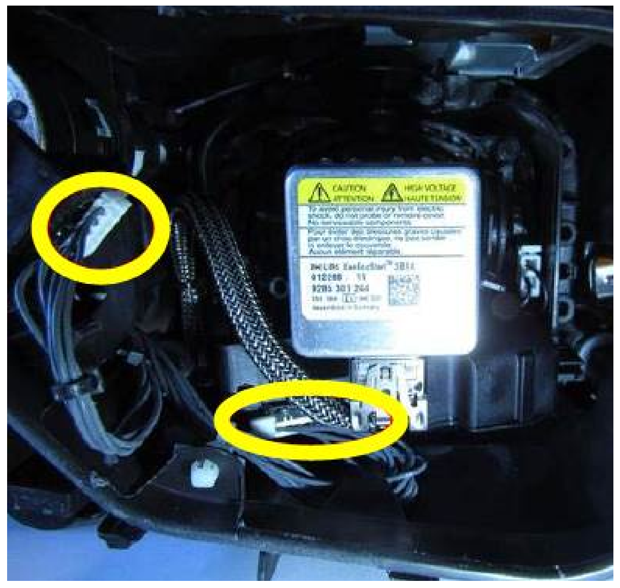
Figure 1. Check these connectors.

Check the connectors shown below (Figure 1). ٠