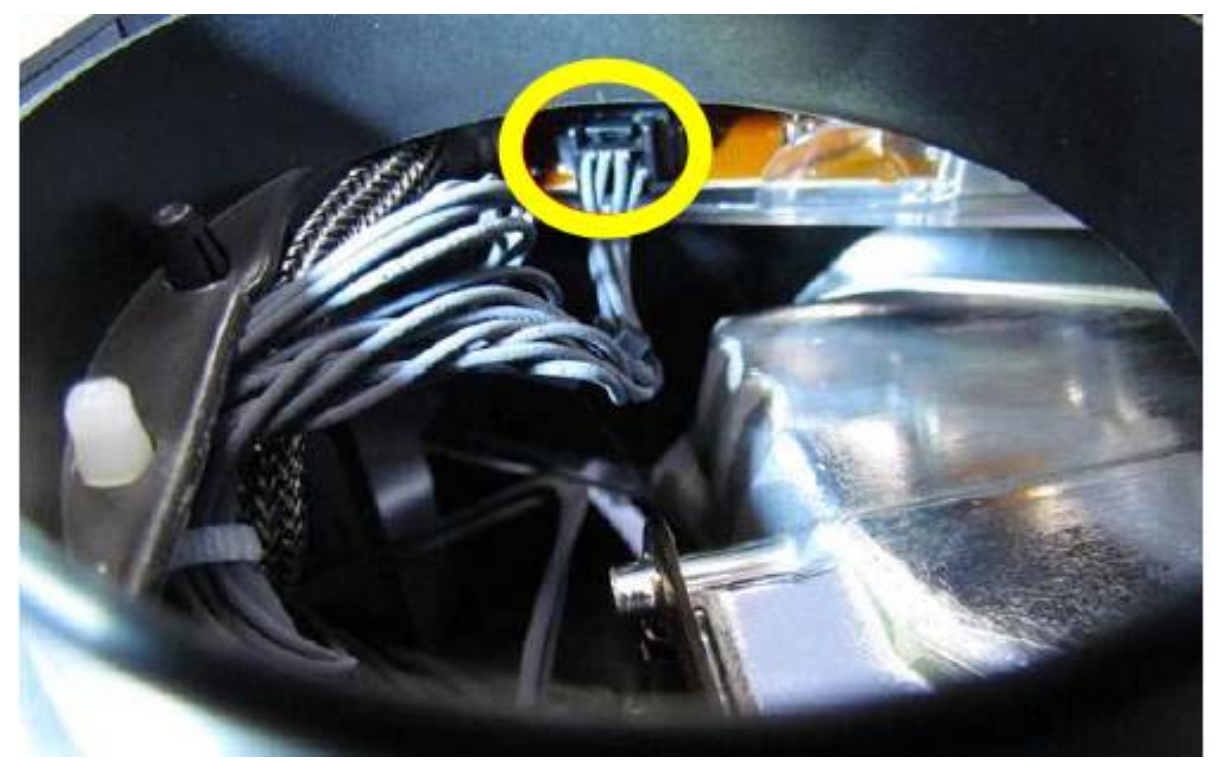
Figure 3. Check these connectors.

• Check connectors shown below (Figure 3 and Figure 4):