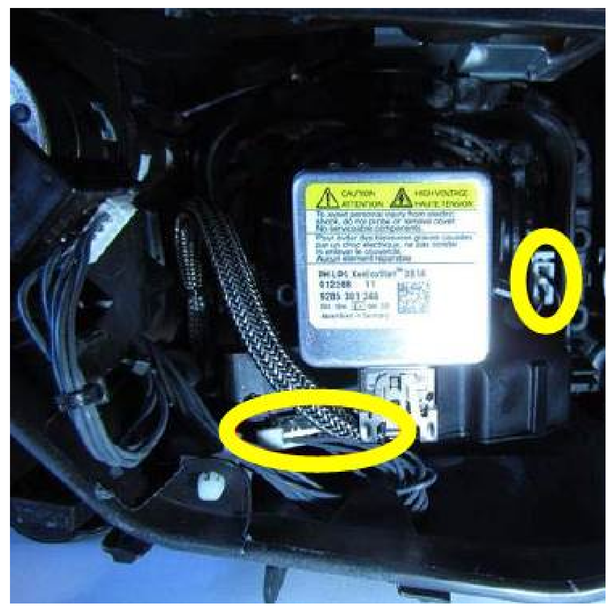
Figure 2. Check these connectors.

• Check the connectors shown below (Figure 2).