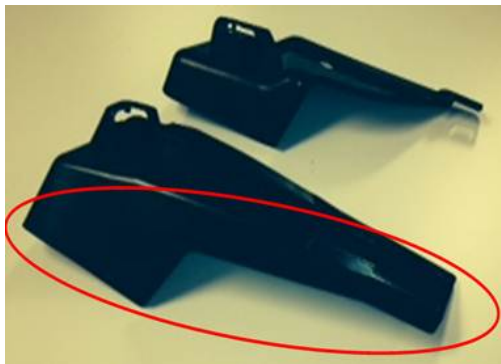
New HVAC air inlet cover 561.815.159C with added material.