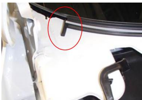
Addition of water deflector 3C0.845.237.