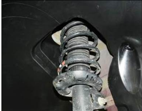
New wheel liner 561.805.912D_9B9 with added material.