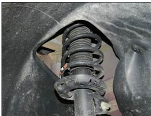
Original wheel liner 561.805.912C.

Excess water/snow enters the water box through the drain port located in the wheel housing. Revised parts.