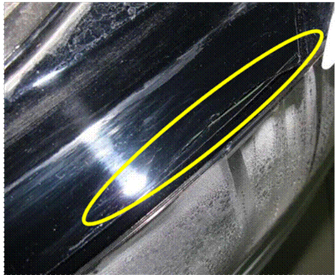
Figure 5. Upper headlight housing cracking.