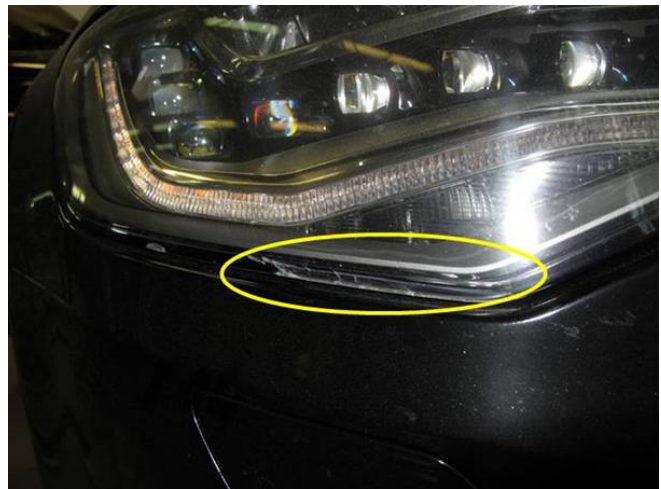
Figure 3. Lower headlight lens cracking.