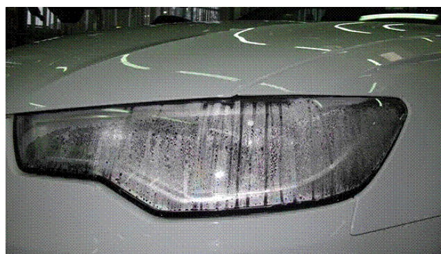
Figure 1. Headlight with heavy condensation

Tip: Review TSB 2012749, 94 Exterior lights, moisture accumulation . Headlights that are applicable to TSB 2012749 do not apply to this bulletin unless cracking is present.