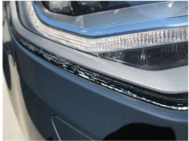
Figure 2. Lower headlight lens cracking.