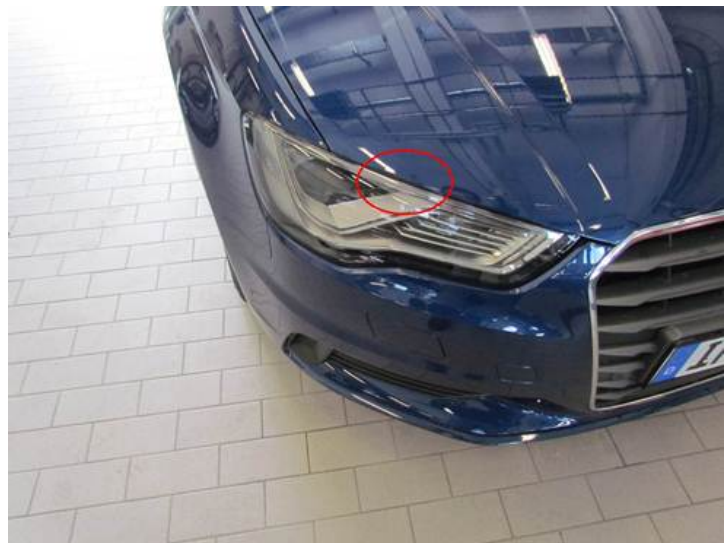
Figure 1. Top area of headlight lens.

There are small crack lines in the top area of the headlight lens (the area covered by the lower edge of the hood) (Figure 1 and Figure 2).