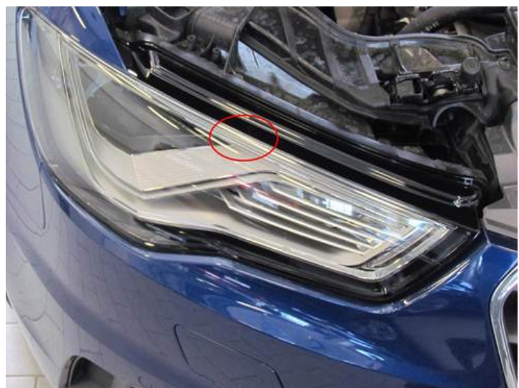
Figure 2. Closer view of area.